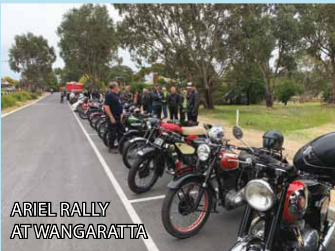
ARIEL RALLY AT WANGARATTA