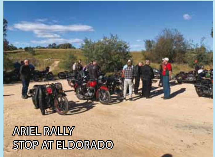
ARIEL RALLY STOP AT ELDORADO